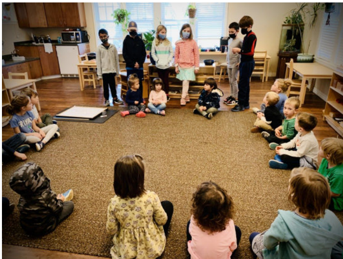
LE—North 3rd year students present their project to an early childhood class.

We have been collecting canned and non-perishable food for the past few days, and it is going very well so far. Two of our classmates donated A BUNCH! We will be collecting food until November 30th, when we will be taking the school bus and delivering the food to the food bank as a field trip. If mostly everyone contributes, then we will have enough for a donation to a local high school food pantry as well. Our goal is to get at least 20 pounds of food to donate. Thanks for your support!